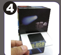
Put the glass plate in Xdigi-USB Device & Grab the X-Ray.