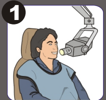
Shoot IOPA X-Ray on Standard Plate.