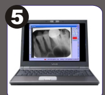
Your digital version of IOPA X-Ray is ready & enjoy Image Editing functionality on it.