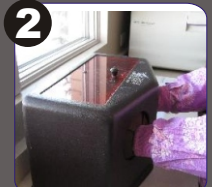
Develop & Fix your X-Ray.